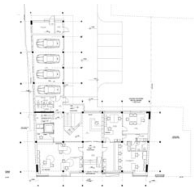
osnova 1. sprata