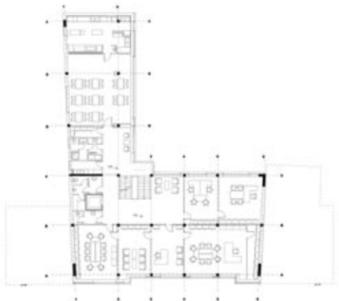
osnova 2. sprata